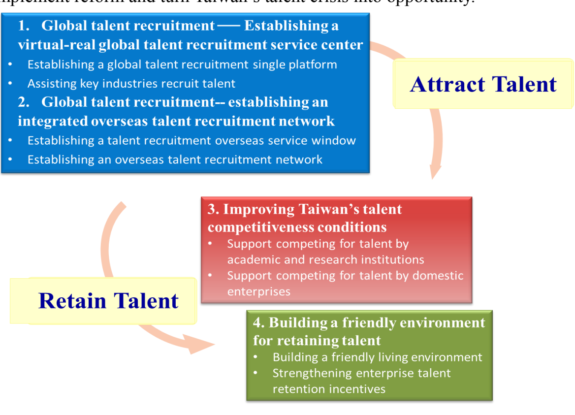
Fig. 3 Objective framework diagram

After talent comes to Taiwan it is important that an active effort is made to make them stay. Through the establishment of a global talent competitiveness mechanism, this program will plan national talent requirements, target key talent for important industries for recruitment, and improve the global talent competitiveness conditions of academia and research and enterprise in Taiwan, build a friendly international talent competiveness environment and implement other innovative strategies, the aim being to achieve more consensus, implement reform and turn Taiwan's talent crisis into opportunity.